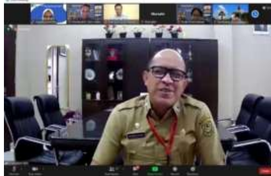
Figure 1. Virtual Seminar Activities