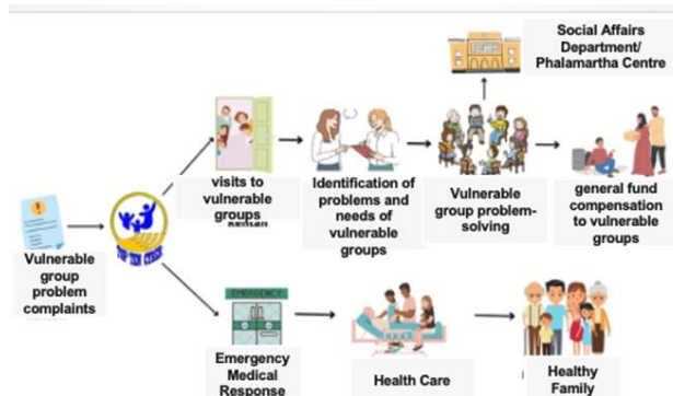
Figure 2. Design Development for Handling Vulnerable Groups

Together with the Community Task Force, an action plan was developed to be implemented in the short and mid-term. In these short- and mid-term program plans, several programs, along with their targets and timelines, were agreed upon. Four programs are planned to be implemented immediately: 1) Understanding Social Welfare Service Recipients (PPKS), 2) Socialization of PPKS, 3) Identification of PPKS, and, 4) Connecting PPKS with resource systems.